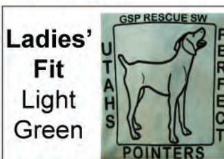
Ladies' Fit Light Green