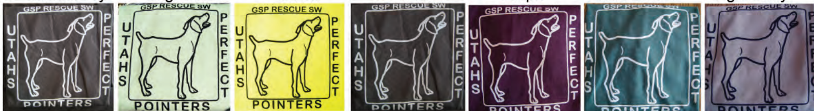
Medium Grey Light Green Fluorescent Yellow Dark Grey Dark Burgandy Funky Green Light Mauve