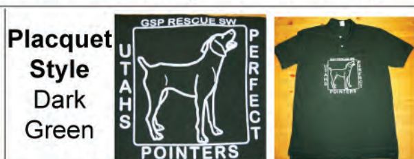
Placquet Style Dark Green